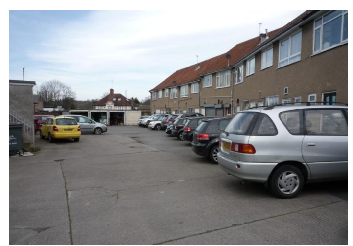
Friday 21st March 12.50pm