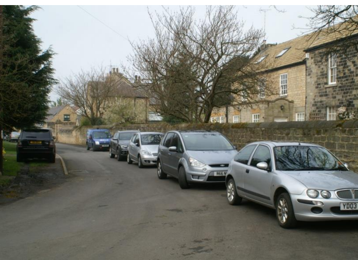
Sunday 30<sup>th</sup> March 10.30am