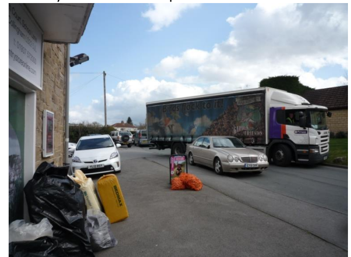
Lorry trapped by car parked on School Lane. Friday 21st March 12.50pm