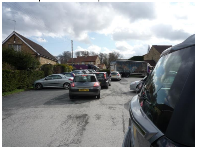
Cars waiting to leave the car park Friday 21<sup>st</sup> March 12.50pm