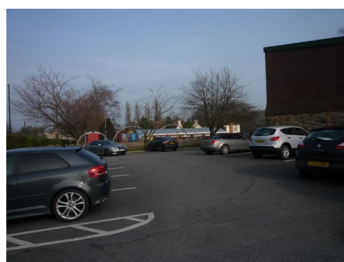
Saturday 29th March 3.10pm