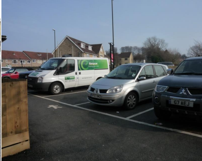
Tuesday 25th March 4.30pm