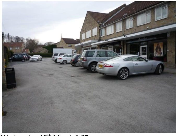
Wednesday 19th March 1.05pm