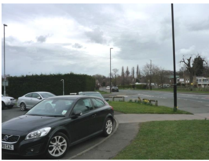
Wednesday 26th March 3.10pm

Concern about parking 9 (1 = not at all concerned: 10 = very concerned)