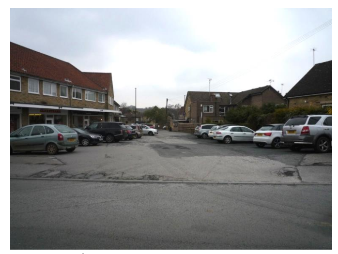
Thursday 27th March 12.15pm